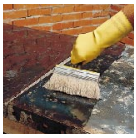
Applying DMA 2000 FORM-RELEASE AGENT with brush

In every case, the user alone is fully responsible for any consequences deriving from use of the product.