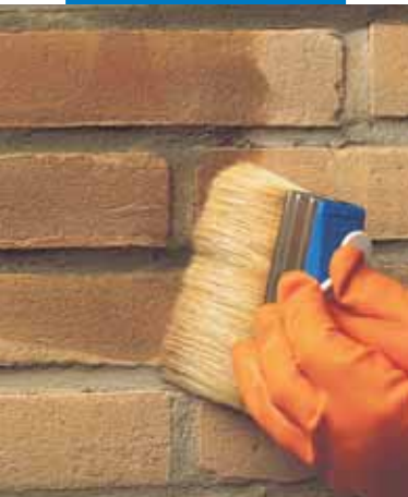
Applying Antipluviol S by brush